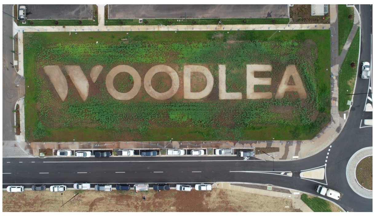
Progress shot, Woodlea town centre.