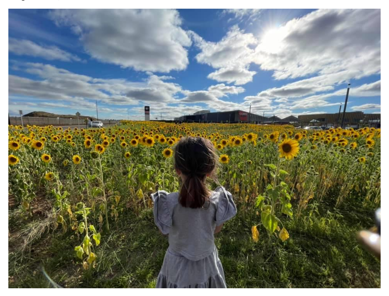
Appendix 7: (Location: Woodlea town centre).