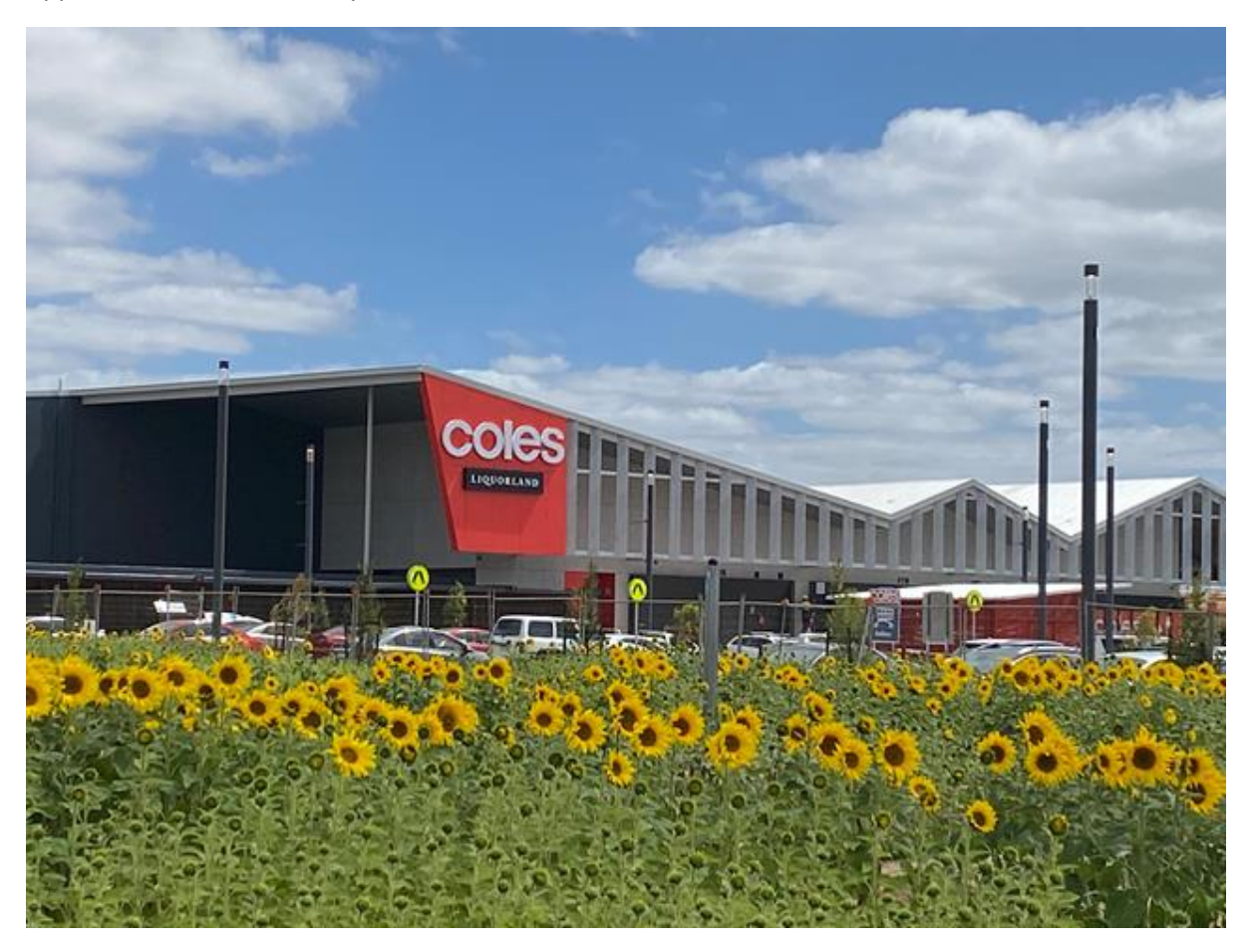
Appendix 6: Woodlea Town Centre sunflowers