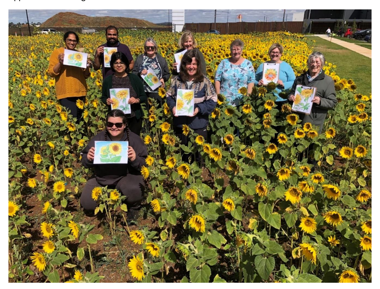
Appendix 4: Mt Atkinson Art Group water colour paintings