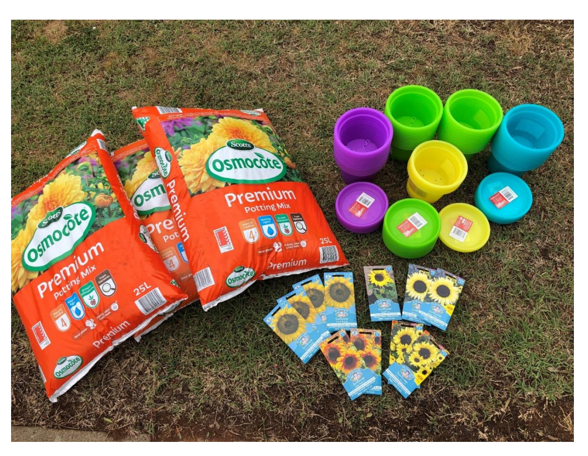
Appendix 3: Bunnings donation for Rockbank Preschool.