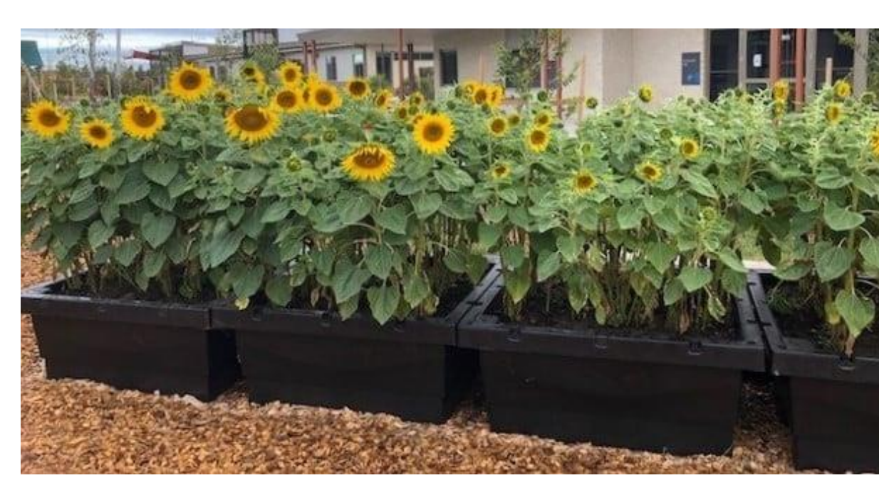
Appendix 5: Aintree Primary School Sunflowers