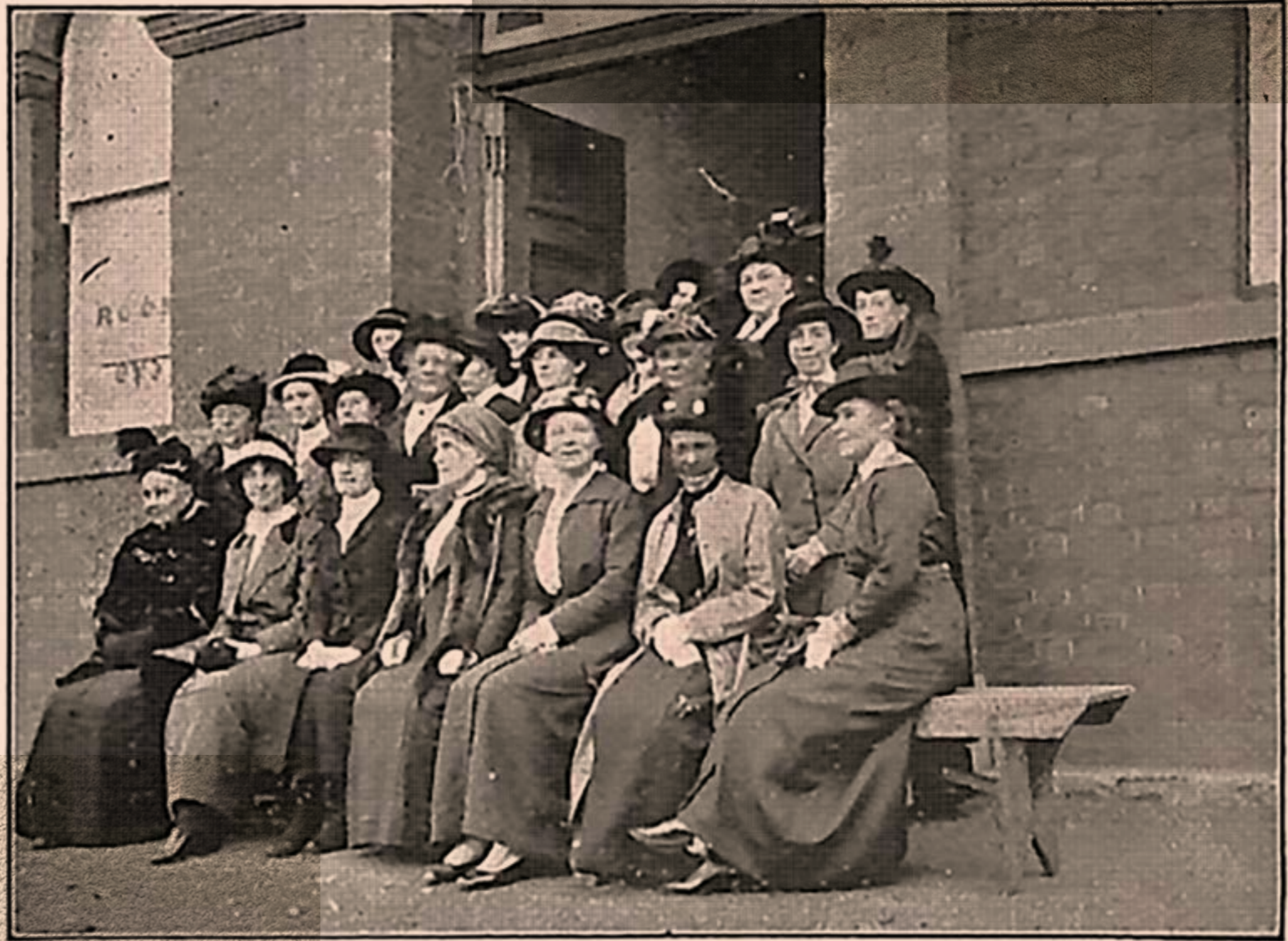
COMMITTEE: MELTON RED CROSS SOCIETY.